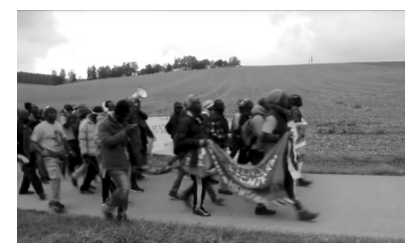
Refugee Struggle for Freedom, Protest March 2016: Day 3: https://www.youtube.com/watch?v=mII8mfpUmZo